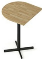
TB CSC 80H