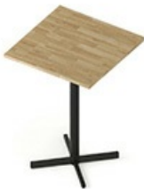
TB CS 80H